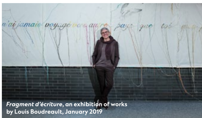
Fragment d'écriture , an exhibition of works by Louis Boudreault, January 2019