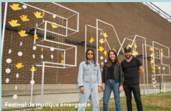
Festival de musique émergente