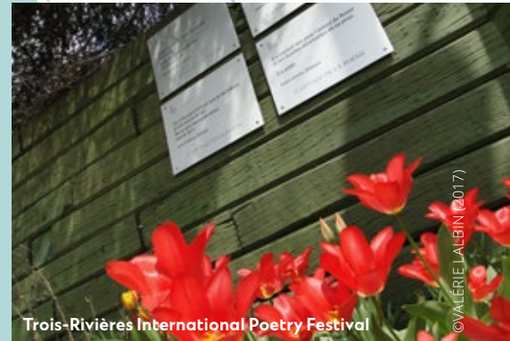
Trois-Rivières International Poetry Festival