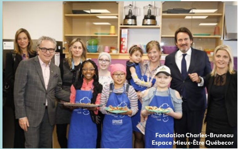
Fondation Charles-Bruneau Espace Mieux-Être Québecor

Here are just some of the organizations in all parts of Québec with which Quebecor partnered in 2019.